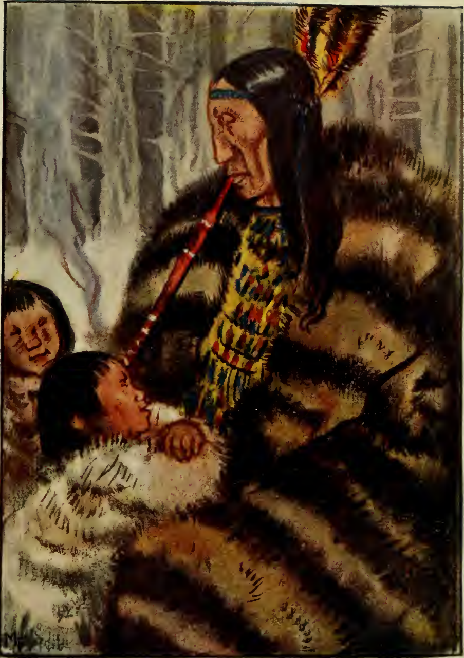
AND THE CHILDREN ALL CAME TO HIM EACH ASKING FOR A BOON